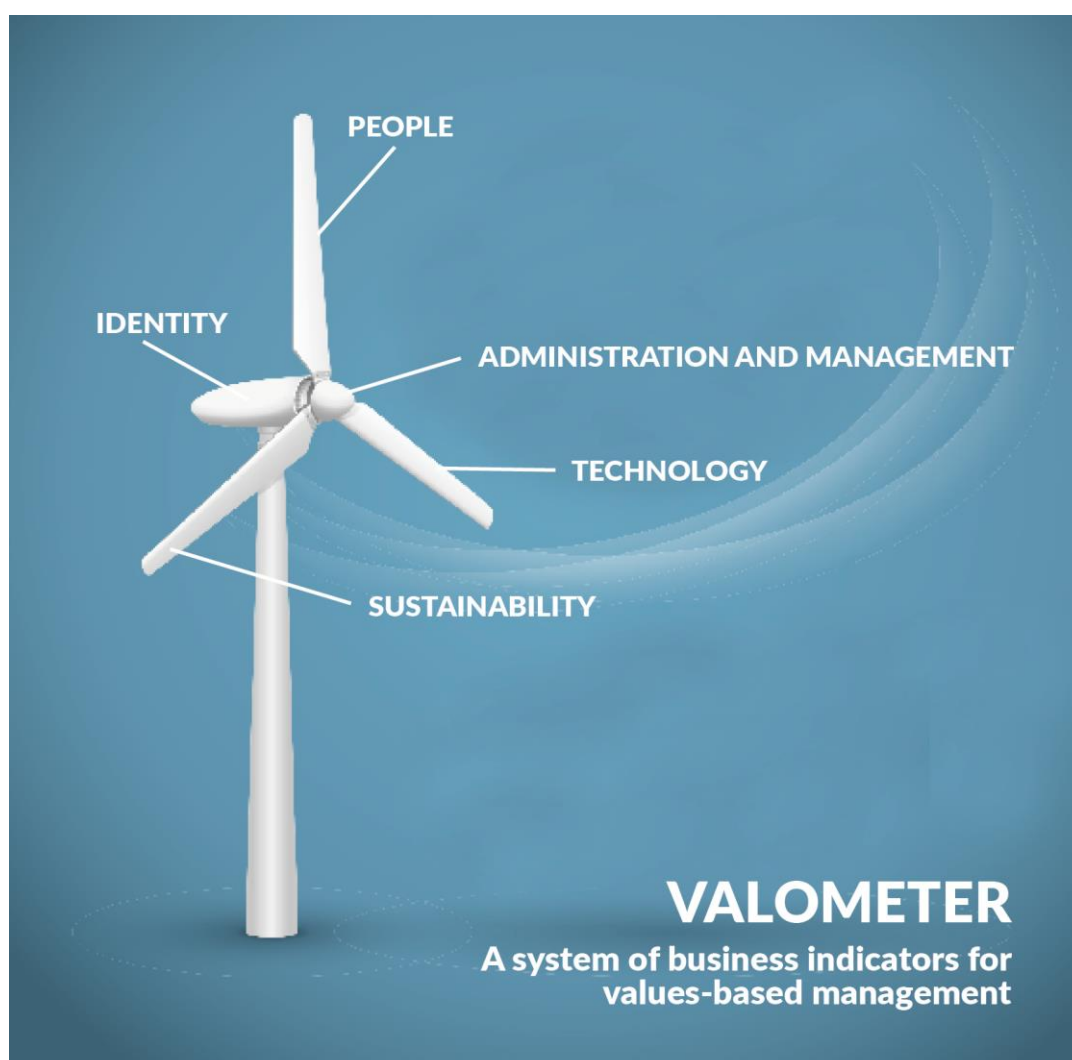
Figure 1. Sections of the Valometer

Valometer, a system of business indicators to facilitate management with values